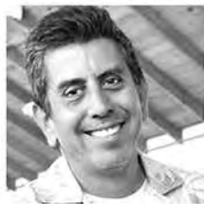
George Perez Corazon de Vida Foundation